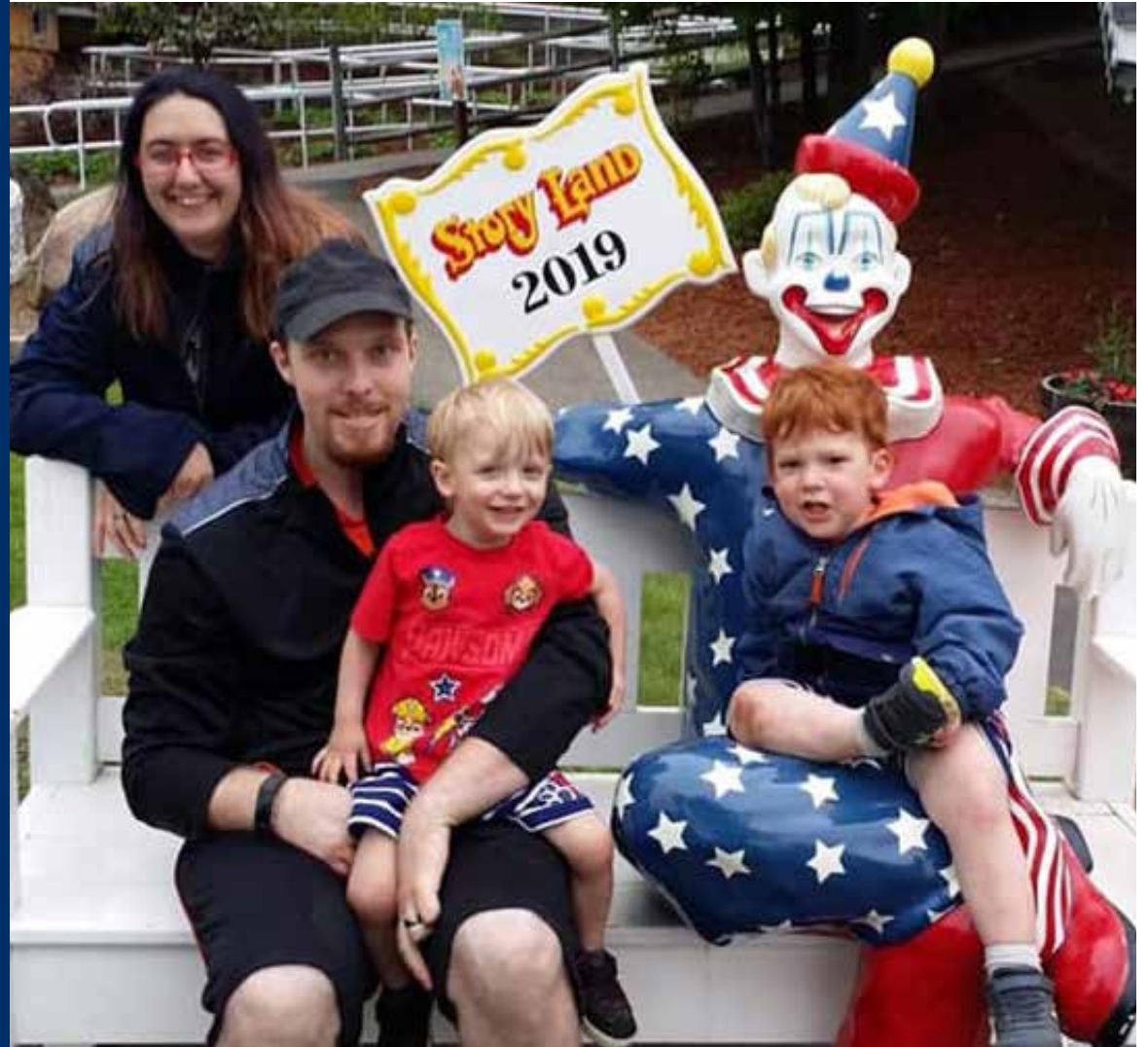
~The Platt Family

We have two boys & sending them to Northeast Woodland is ideal for our family. Our sons love the outdoors and are very active, Waldorf allows our sons to be up moving and learning.